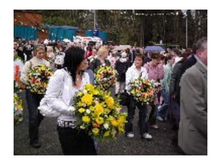
The photos below are An Fhirnne families of members murdered by collusion/state sponsored violence