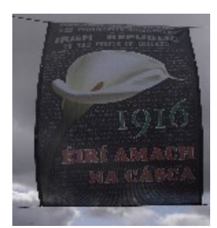
Illustration 2: Proclamation Banner